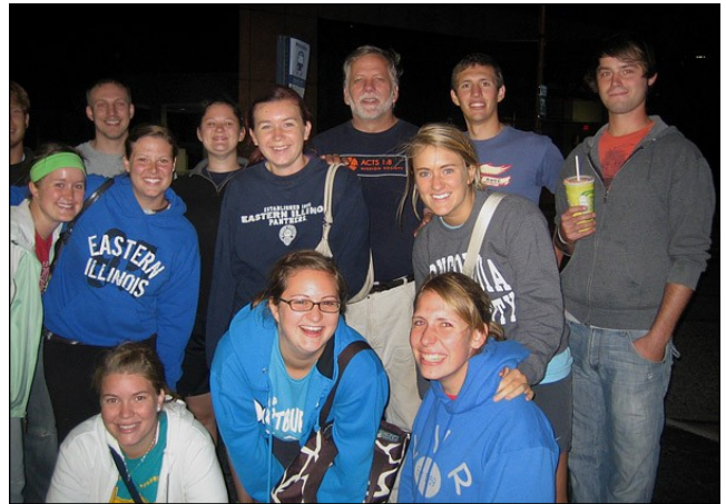
Photo: Students and leaders at LCMS Campus Ministry and Acts 1:8's first Student Mission Challenge event.

Stay tuned to the LCMS Campus Ministry website for information about upcoming Student Mission Challenge opportunities.