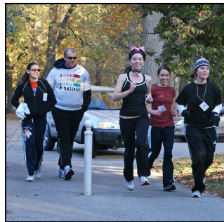
St. Louis, Mo.