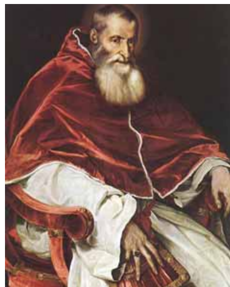
Paul III was pope from 1534 to 1549, including the last years of Martin Luther's life.

The treatise was, as Melancthon noted, a sharp condemnation of papal usurpation of authority.