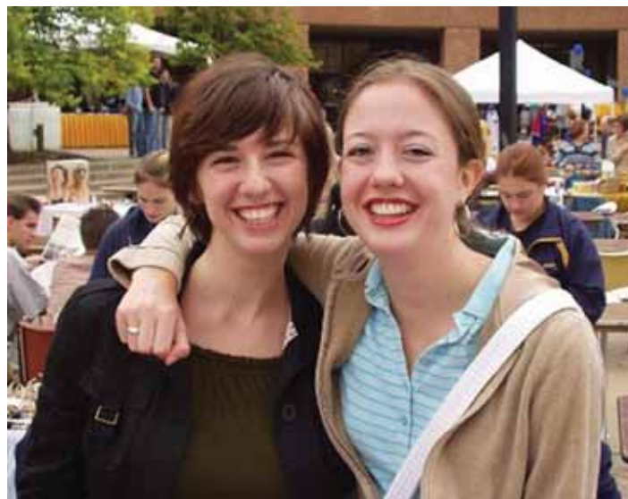
Students representing Lutheran Campus Ministries of Kent State University meet fellow students at a welcoming booth at The Black Squirrel Festival, the school event to introduce new students to college and community organizations.