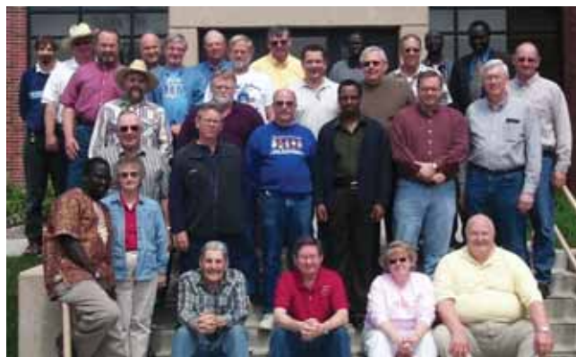
Recent students at the Nebraska District Lay-Leadership Program take a moment for a class picture on the campus of Concordia University—Nebraska in Seward.

There are many examples of the impact of equipping laity for their