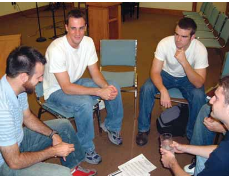
Students at Alleluia Lutheran Church and Student Center, Arizona State University, meet in informal, small-group ministries. These groups are designed to encourage each member to maturity in worship, mutual edification, and evangelism.

when, studies show, an alarmingly high number of young people struggle with serious problems like depression. Those years also are when students face decision-making challenges about sex, alcohol, and drugs as well as choices regarding careers and possible mates.