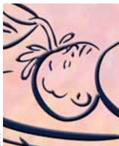
A Festive Affirmation Page 9